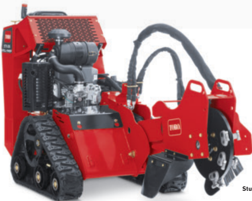
STX-26 Stump Grinder